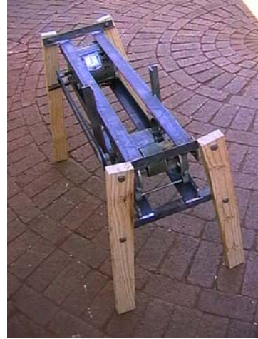
Fig. 4: Braces keep the frame sturdy.

I went to the supermarket to find a funnel with the correct diameter throat – it happened to be a bubble bath container, shown in Figure 5. No matter how hard you may try to cut the funnel to the shape of the rollers, duct tape is virtually essential for a good seal. It forms a little apron on the inside, against the roller, that works very well. I used a staple gun to secure the top end of the funnel to the plywood table that supports the malt bag.