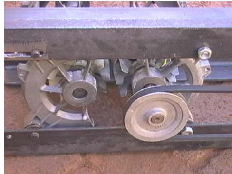
Fig. 2: Keep the bearing housings, but cut them to get the two armatures close enough to each other.

All of the washing machine motors that I got have the same mountings. This makes things quite easy. Note the mountings on Figure 2 – the left-hand roller is mounted with two 6mm bolts, with the bottom one fixed, and the top mount is in a slot for setting the gap between the rollers. The right-hand roller is not adjustable, so I used 10mm screws inserted directly in the rubber mounts that come with the motors (not shown). I used four pieces of 50mm angle iron as the mounting frame.