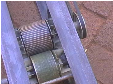
Fig. 1: The armatures from two burnt-out washing machine motors make good rollers.

Start at your local home appliances repair shop. My local dealer had plenty of 2 nd hand washing machine motors. I bought three from him for R280, only one was in working condition. The two burnt-out motors were taken apart, and I threw away the outside shell, which contains the electrical windings. On the inside is a solid armature, which makes a great roller for your malt mill: see Figure 1.