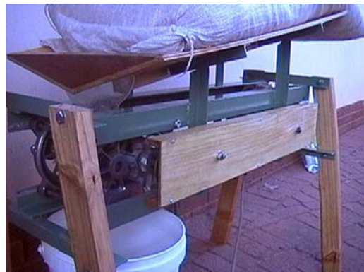
Fig. 6: The completed mill.