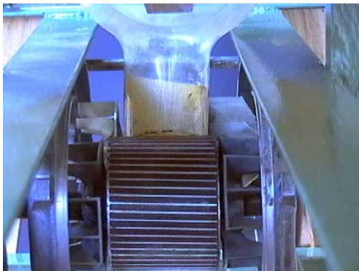
Fig. 5: The funnel is best sealed with duct tape.

The motor hardly changes tone when milling. It effortlessly mills 10kg in about 5 minutes, and gives a good quality grind. If you want to try this project for yourself, feel free to contact me at mike@heydenrych.info .